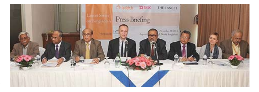
Lancet pre-launch press briefing

commentaries (http://www.lancetjournals.com/bangladesh), a perspective (http://www.thelancet.com/journals/lancet/a rticle/PIIS0140-6736(13)62306-5/fulltext), and a communication (http://www.thelancet.com/ journals/lancet/article/PIIS0140-6736(13)62394-6/fulltext). According to The Lancet this six-part Series takes a comprehensive look at one of the "great mysteries of global health", investigating a story not only of "unusual success" but also the challenges that lie ahead as Bangladesh moves towards universal health coverage. In the Call-to-Action, the authors called for a long term HRH strategy and plan, establishing national health insurance, an interoperable health MIS, strengthening ministry of health and family welfare, and establishing a supraministerial council on health for achieving universal health coverage.