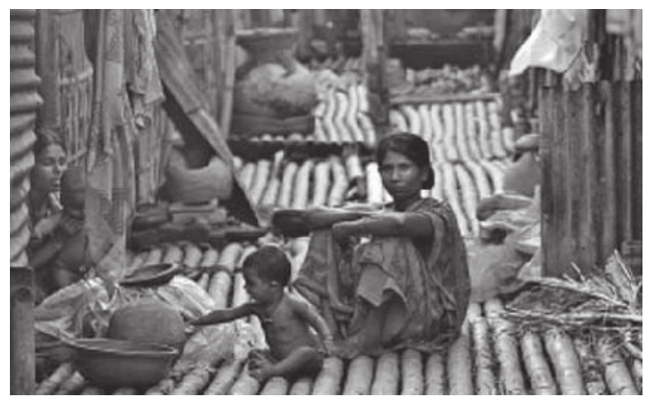
Disadvantaged population at higher risk of impoverishment due to catastrophic OOP health expenditure

Garrett L, Chowdhury AMR, Pablos-Mendez A. All for universal health coverage. Lancet 2009; 474:1294-99.