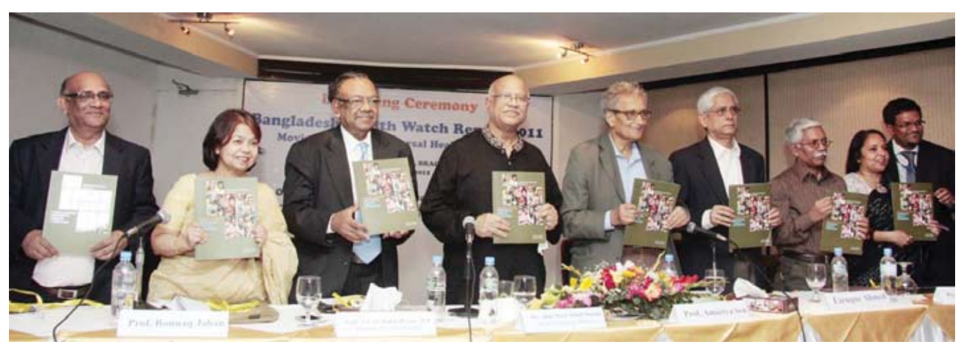
Official Launching Ceremony of BHW's report on Universal Health Coverage